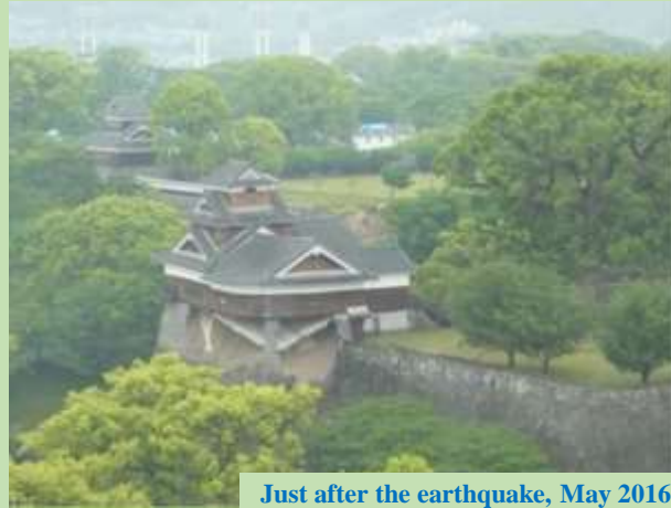
Just after the earthquake, May 2016

This building became very famous because it kept standing against the earthquake with a line of corner stones.