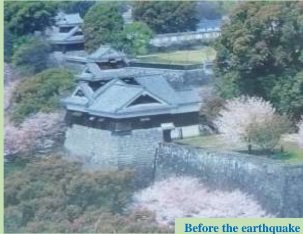
Before the earthquake