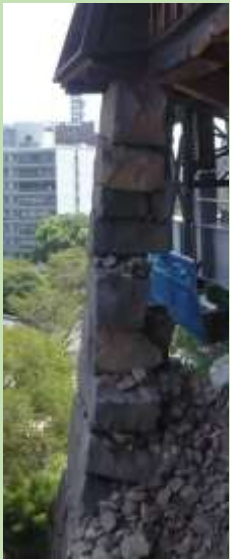
Corner stone like a column

This building became very famous because it kept standing against the earthquake with a line of corner stones.