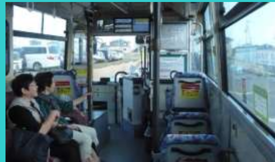
名取市バスなとりん号